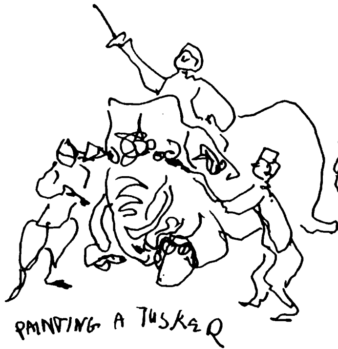
PAINTING A TUSKER