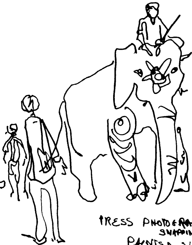
PRESS PHOTOGRAPHERS SNAPPING PAINTED ELEPHANT ● SINGHA DUBBA