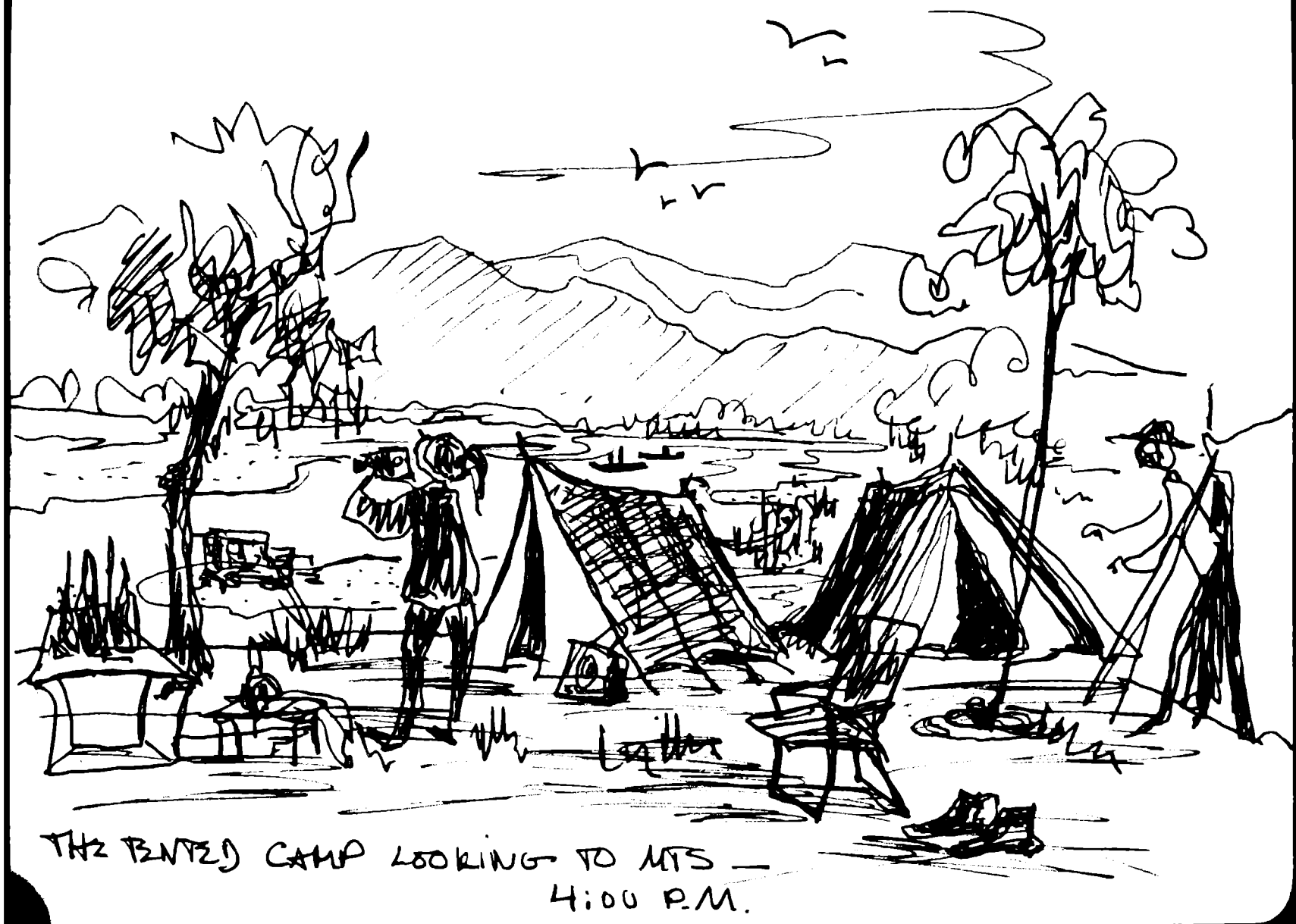
THE TENTED CAMP LOOKING TO MTS — 4:00 P.M.