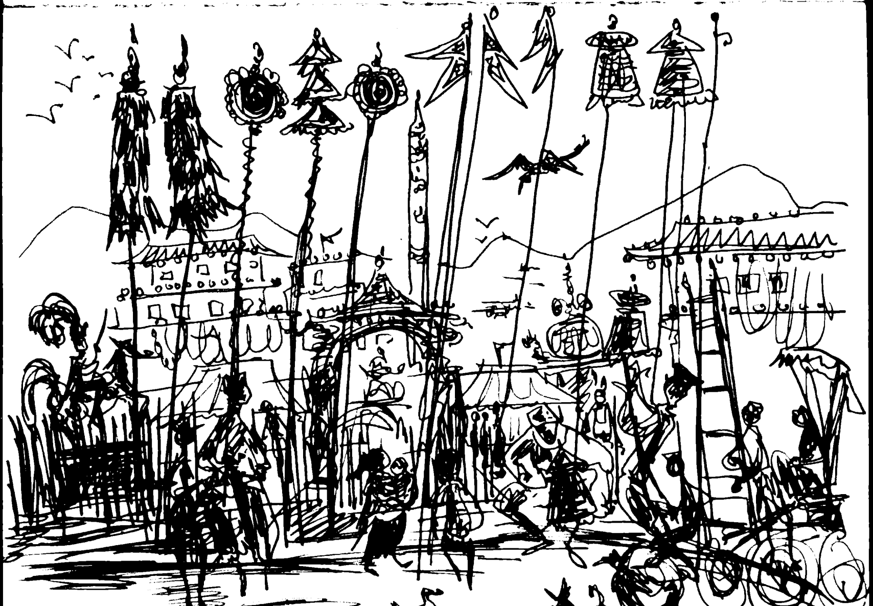
DEUNTOUN KATMAVU CORONATION EVZ, FEB 23 d , 1978